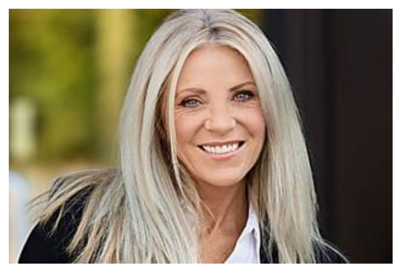
7 of the Worst Retirement Mistakes You Can Make Sponsored | SmartAsset

Charges reinstated against Navy Corpsman in case of Green Beret contractor killed in Iraq Task & Purpose