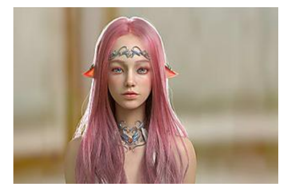
A Game Where Everything Is Allowed! Sponsored | RAID: Shadow Legends