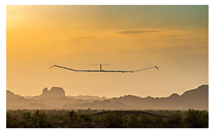
After 64 days, the Army's drone that wouldn't die has died [Updated] Task & Purpose