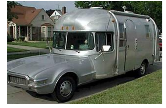
30 Of The World's Most Bizarre Motorhomes Sponsored | Yeah Motor!