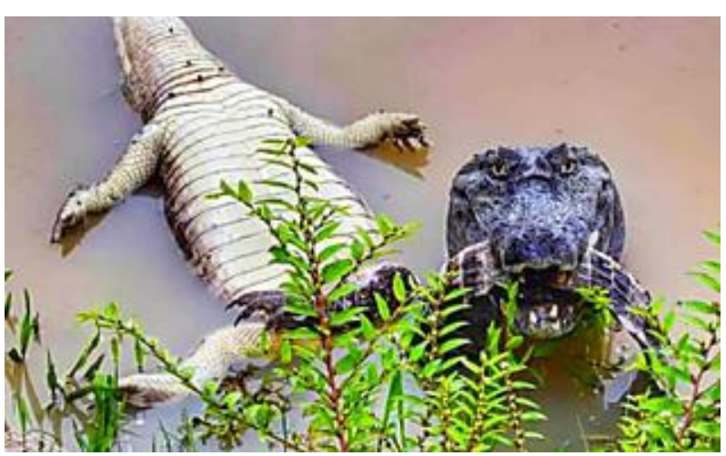
[Pics] This Image Proves How Scary Mother Nature Is Sponsored | History Daily