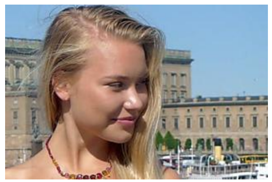
30 American Stereotypes Foreigners Can't Stand Sponsored | Auto Overload