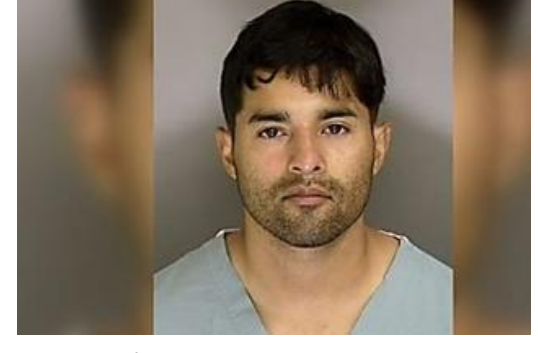
Former Air Force sergeant sentenced to life for killing a cop in the name of... Task & Purpose