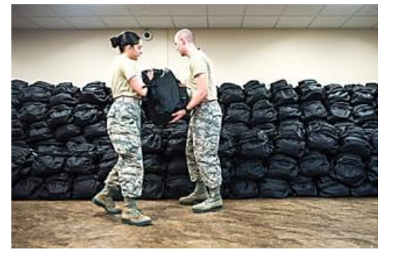
The best survival backpacks for overcoming unexpected emergencies Task & Purpose

Most Affordable Camper Vans Sponsored | Camper Vans Warehouse